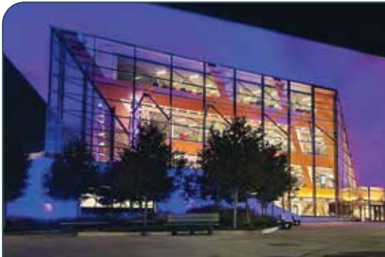
Confederation Building, St. John's, NL

And the fifth-anniversary of Light It Up! For NDEAM™ on Thursday, October 17 was also a record-breaking, history-making event! Over 800 locations in almost 200 communities lit purple and blue.