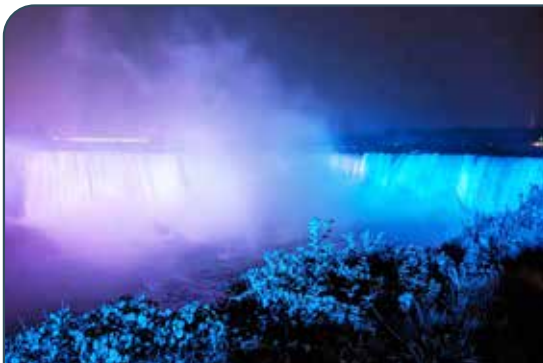
Horseshoe Falls, Niagara Falls, ON