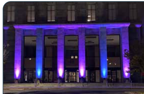
National Printing Bureau, Gatineau, QC