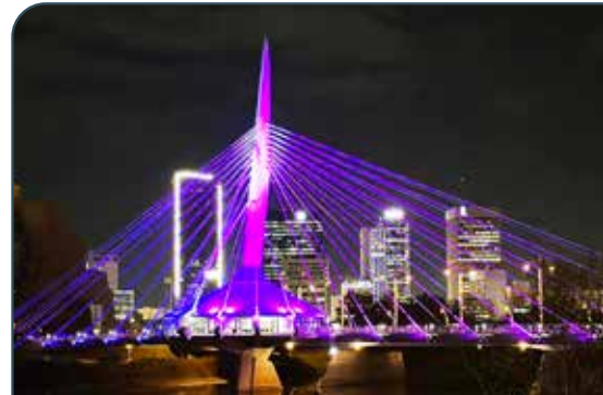
Esplanade Riel, Winnipeg, MB